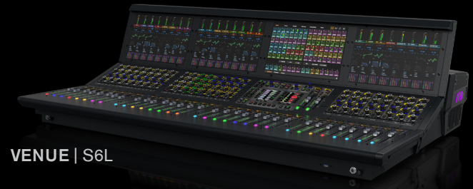
VENUE | S6L