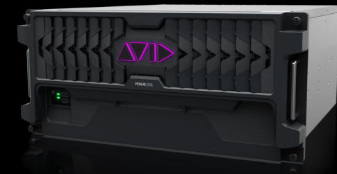
VENUE | E6L